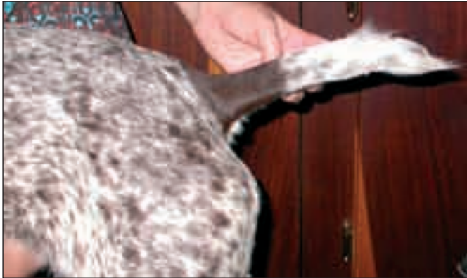
Fig 5. A properly docked tail of a German Shorthaired Pointer.