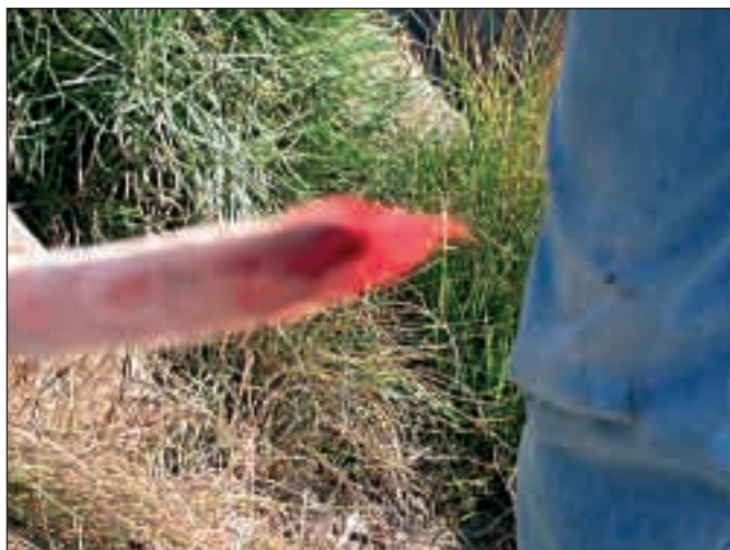
Fig 3. English Pointer tail injury at the Border Field Trials in 2002 after 10 minutes working in grassveld. The blurred image is as a result of the constant movement of the tail that keeps worsening the injury.