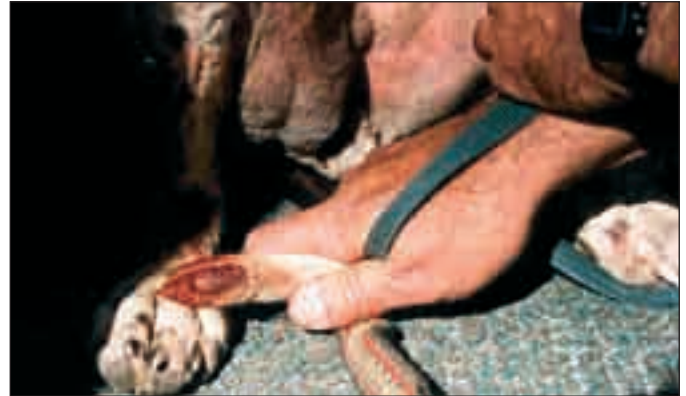
Fig 6. Tail injury in an English Pointer exacerbated by constant licking and banging against objects

Nevertheless, the English Pointer suffers regularly from tail injuries, especially when worked in thorny bushveld areas. Figures three and four indicate such injuries that have been suffered during a ten minute round at field trials and that occurred in relatively thorn-free grassland areas. By contrast, no injuries to the tails of the shorthaired German Pointer breeds, which are normally docked, can be recalled over the past 17 years in South Africa. This can only be ascribed to the fact that the tails of all working German Pointer breeds have been docked up to now.