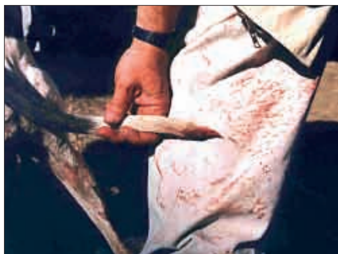
Fig 4. English Pointer injury at the Natal Field Trials in 2001 after a 10-minute round in mainly grassveld. Notice the blood spattered trousers of the owner as a result of the constant tail movement.