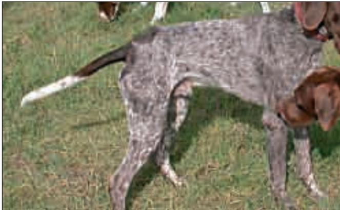
Fig 1. An undocked German Shorthaired Pointer tail. Compare the carriage and length in proportion to the body with that of the English Pointer (Fig 2).

Docking is a humane procedure that, when properly carried out, prevents serious injury and distress. Unlike neutering, tail docking is far less stressful with no hormonal or other side effects. Wingshooters, breeders of working dogs, field trial clubs and veterinarians who own gundogs agree that If tail docking is banned, the dogs would suffer and that failure