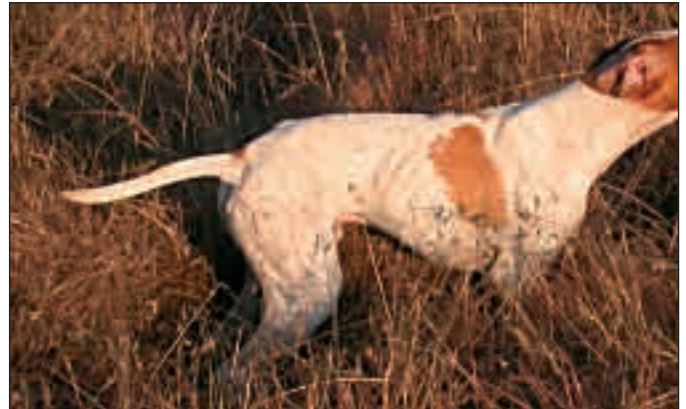
Fig 2. English Pointer tails are not docked, mainly as a result of a relatively short tail and the terrain in which they work. Still, they sustain serious injuries in South Africa (fig 4).

to dock constitutes animal cruelty. This position is endorsed by the SA Wingshooters Association, the Hunt, Point and Retrieve Field Trial Association, the Working Spaniel Association, the Weimaraner Club and the Field Trial Liaison Council of KUSA which represents all gundog field trial organisations in South Africa.